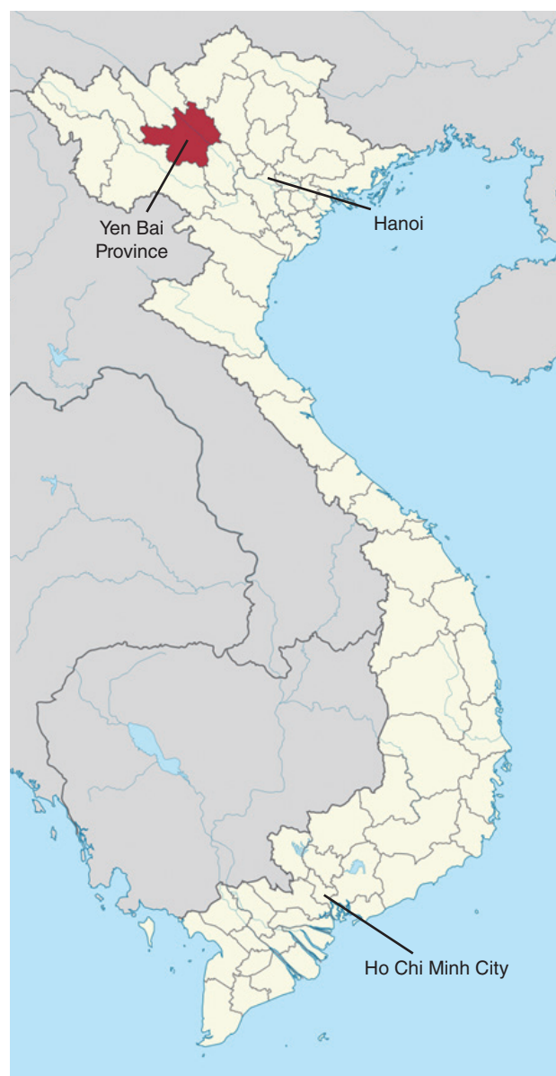
Fig. 1. The surveyed area (red region), Yen Bai province, northern Vietnam.

with ice to the laboratory of Department of Parasitology and Tropical Medicine, Gyeongsang National University College of Medicine, Jinju, Korea. Their length and weight were individually measured and the fish species were identified with the aid of a Korean ichthyologist and Search FishBase site in internet (Table 1) [24]. Individual fish was finely ground in a mortar with pestle, the ground fish meat was mixed with artificial gastric juice, and the mixture was incubated at 36°C for about 2 hr. The digested material was filtered through a 1 × 1 mm 2 of mesh, and washed with 0.85% saline until the supernatant became clear. The sediment was carefully examined under a stereomicroscope. The metacercariae of each species (only ZTM) were separately collected viewing from the general feature and counted to get hold of the prevalence (%) and intensity of infection (no. of ZTM per fish infected) by fish species [5].